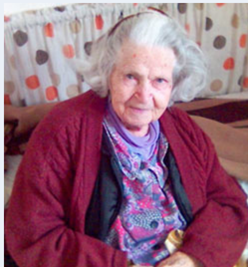
Social Assistants provide social services to the elderly in their communities

Three factors were critical for the success of the initiative. First of all, its long-term perspective (six years) was vital to fully institutionalize a new system. Secondly, SANE activities complemented a change process, which was entirely driven by Bulgarian institutions. Lastly, the project took a holistic approach with activities at various levels – work on the policy framework was complemented with capacity development activities for municipalities and NGOs, as well as employment creation for the once unemployed.